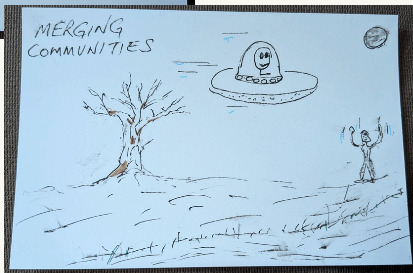
Figure 2: Participant drawings of their visions and hopes