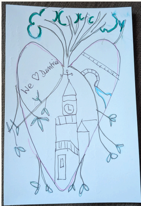
Figure 4: Participant drawings of their visions and hopes of creating a neighbourhood residents are proud of.

Participants expressed a hope for transformative community-led holistic change, shifting power to communities and ensuring they become confident community leaders. This vision moves communities from consultation toward local authorship, where they are heard and can see their ideas to improve their local spaces actualised. By challenging external public perceptions of what a ‘good town looks like’ local communities can reclaim and redefine their narrative of place. This process of leading change strengthens the collective bond, fostering a deep sense of local pride and a renewed appreciation for the Gaelic language and culture. Ultimately, the hope is that pride becomes a tangible result of shifting power and the community’s agency in shaping the neighbourhoods they bide.