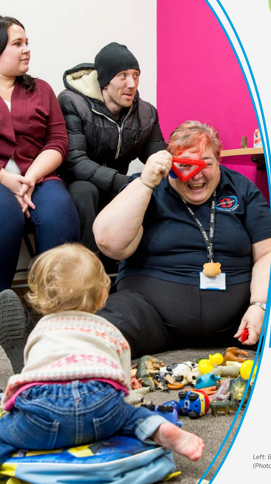
Left: Big Local Brookside