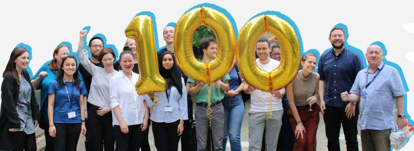
Left: South Bermondsey Big Local