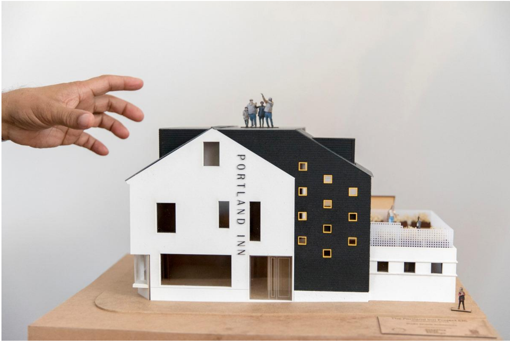
Community Led redesign for a community building