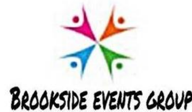
BROOKSIDE EVENTS GROUP