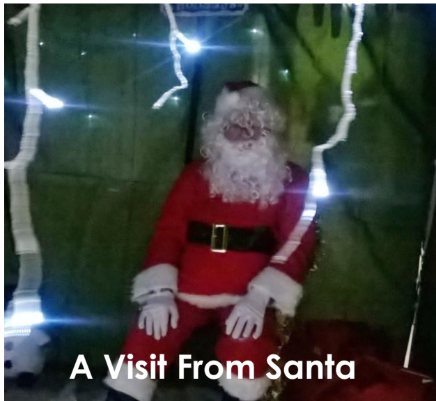
A Visit From Santa