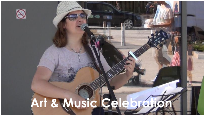
Art & Music Celebration