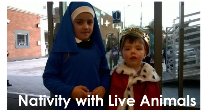
Nativity with Live Animals