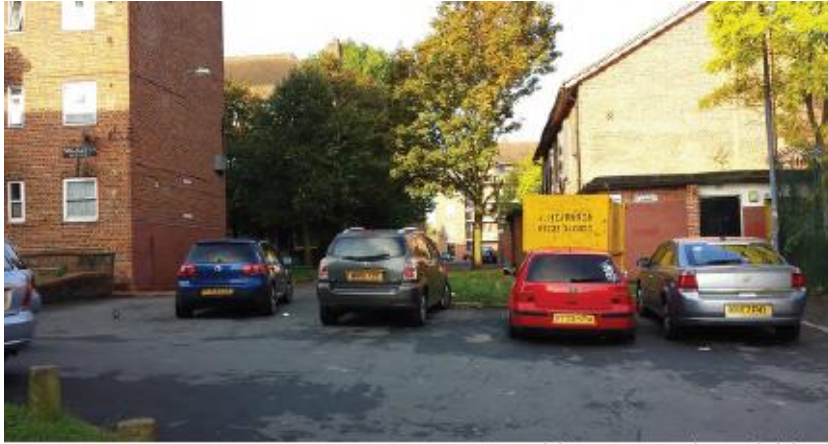
View of the east-west pedestrian link from Wrottesley Road beside the Medical Centre