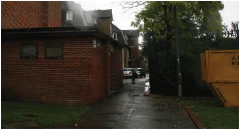
View of the narrow pedestrian passage between the disused community centre and the Medical Centre