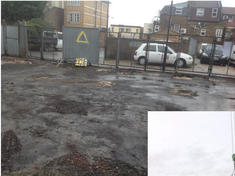
The preparation and groundwork